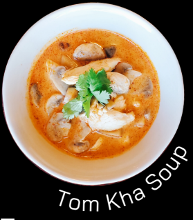
Tom Kha Soup