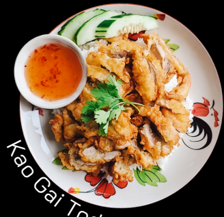
Kao Gai Tod